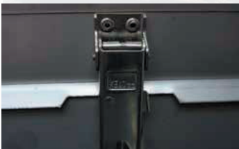
1. New Latches and Latch Keeper Heavy duty stainless steel latches and keeper