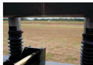
9. Sight Window Operator can now watch the material flow to insure there are no blocked hoses