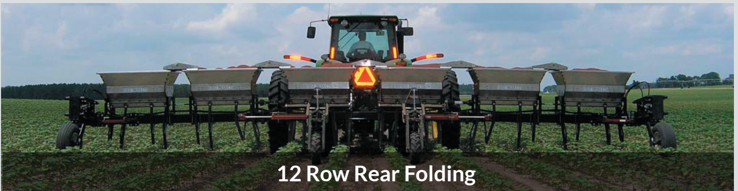
12 Row Rear Folding