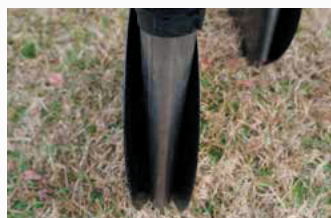
8. Stainless Steel Down Spout Stainless down spout to prevent rusting