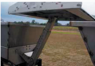
4. Bridge Adjustable bridges allow hoppers to be covered with the tarp covers