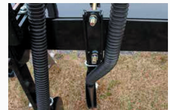
6. New hoses Improved hose material for better elasticity