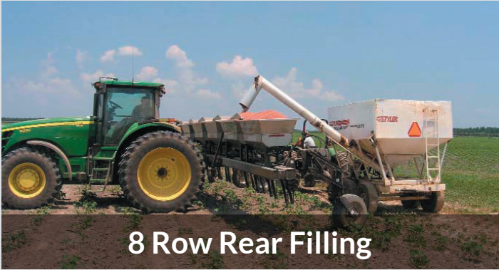
8 Row Rear Filling