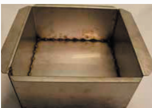
7. Calibration Cube All Fertilizer hoppers come with a cube for measuring bulk density for easy calibration.