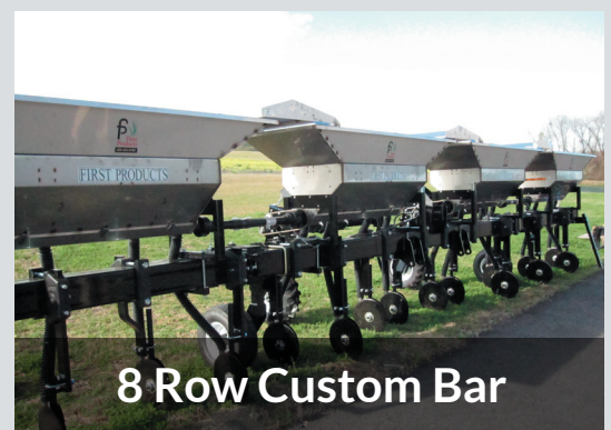
8 Row Custom Bar