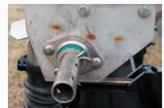
10. Auger Bearing Seal New seals are extra durable and more resistant to chemicals.