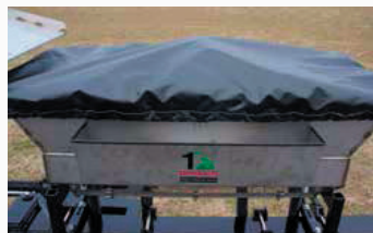
5. Tarp Covers and Cover holder Box covers and cover holder included with 750lb. extensions