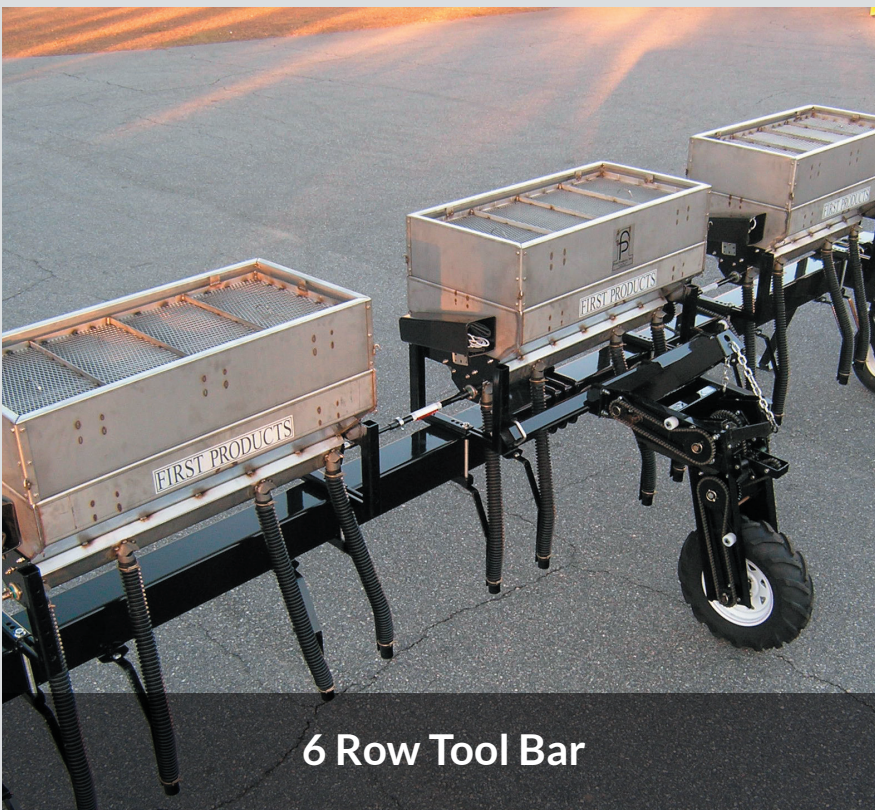
6 Row Tool Bar